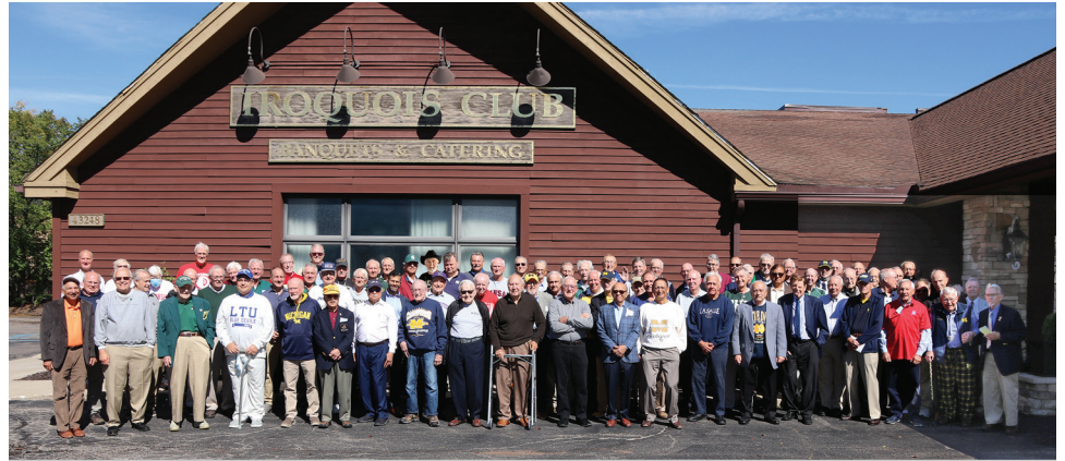
9/24/2021 - Senior Men's Club - College Colors Day